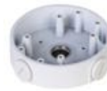
PFA139 Junction Box