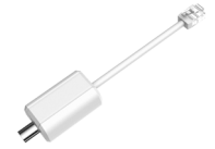
LR1002 ePoE Over Coax Converter