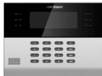
DS-19A08N-F/K1 or DS-19A08N-F/K1G

The control panel is mainly applied to shopping malls, stores, residences, apartments, communities and so on. It can push the real-time alarm information to the mobile app and implement the function of remote arming/disarming.