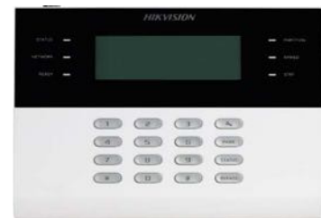
DS-19A08N-F/K2 Or DS-19A08N-F/K2G