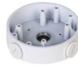
PFA139 Junction Box